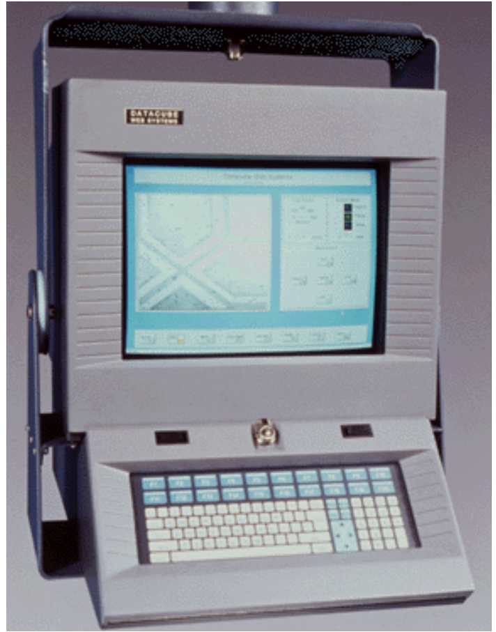
Operator Interface includes gray-scale display and can be positioned close to or away from the web